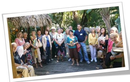
Bus Trip to New Smyrna Beach

Published bi-annually, “Le Salon” keeps you informed about current gallery exhibits and events, upcoming professional development programs, educational opportunities and more.