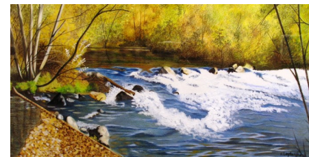
Josephine Leyte-Vidal, “Rapids”

Individual ..... $40 CF Student.....FREE with a copy of current CF student ID