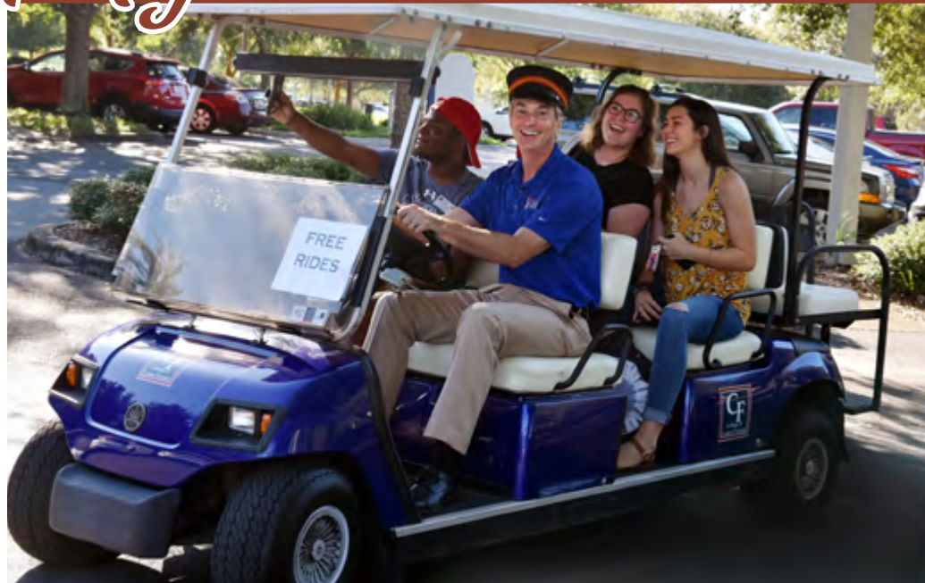
We welcomed students to fall semester with golf cart rides to their classes. I enjoyed sharing in their excitement of new beginnings.